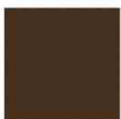
Painted metal Mat bronze