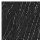
Mat ceramic Laurent