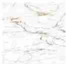
Silk finish ceramic Calacatta macchia vecchia