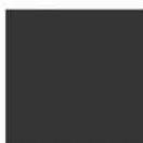
Painted metal Mat lead