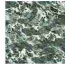
Marble Saint Denis