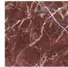
Marble Rosso Carpazi