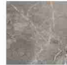
Marble Fior di bosco